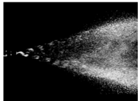
High-speed image of the OsciJet HPX-MS nozzle used for oil injection in a commercial gas turbine. The jet dynamic can be observed at the tip of the nozzle.